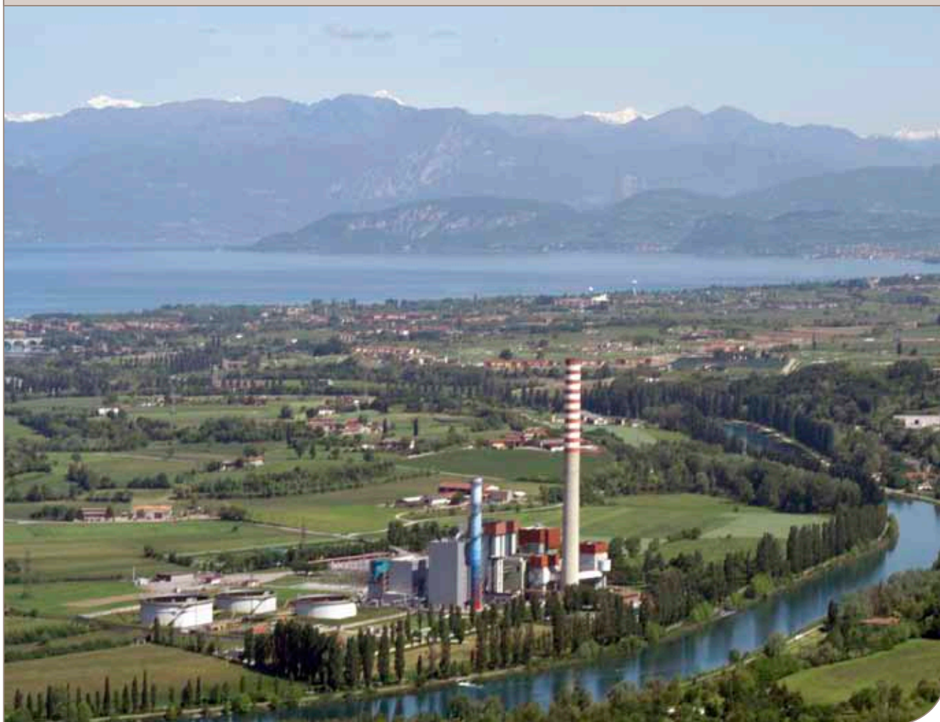
Mincio Thermoelectric Power Plant (aerial view)

A thermoelectric power plant works on a continuous cycle. Turbines, alternators and auxiliary components all have to be constantly cooled to avoid a loss of power plant output and possible damage to machinery. The heat exchangers therefore have an important role to play. The 380 megawatt Mincio Thermoelectric Power Plant, which is owned by four northern Italian public limited companies, has two Alfa Laval M30 heat