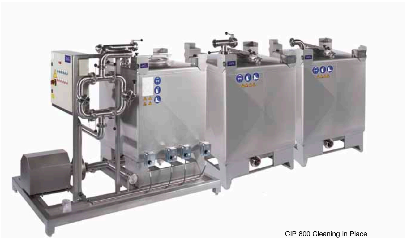
CIP 800 Cleaning in Place

Ponti sul Mincio is in the province of Mantua, just south of Lake Garda. Along the Mincio, one of the loveliest of Italian rivers, the Mincio Thermolectric Power Plant has stood since the end of the sixties within the Parco del Mincio, in an area of high landscape value: this plant is owned by four northern Italian public limited companies, which were formerly municipal undertakings, (A2A, the result of the merger of AEM Milano and ASM Brescia, AGSM Verona, AIM Vicenza and Trentino Servizi). The plant consists of a gas-fired combined cycle turbine (the heat from the gas turbine exhaust gases is recovered by a steam generator which powers a steam turbine). The owner companies sell the electrical energy on the market through the relevant stock exchange or supply private and industrial clients directly.