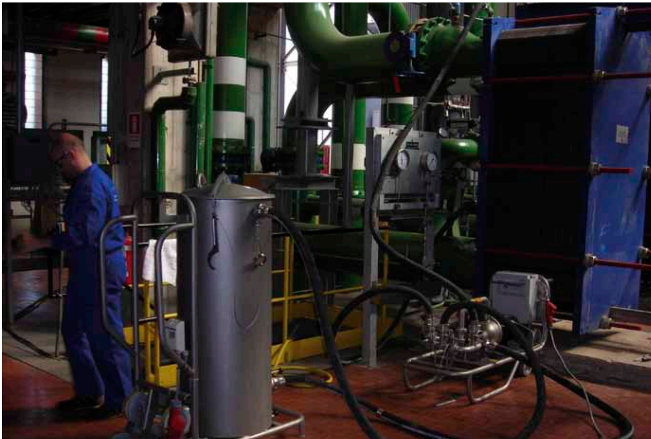
M30 heat exchanger installed at customer's plant

leasing our cleaning unit and a performance agreement was sealed on a two-yearly basis based on the Performance Audit system." By collecting data on the operation of the exchangers and processing the data, Alfa Laval predicts when the critical point is approaching and identifies when cleaning will be needed. "Since the plant works continuously," continues Di Martino, "we suggested a fixed maintenance timetable at a pre-determined price. In other cases we use Performance Audit without scheduling maintenance operations in advance but carrying out work when the data shows it is needed."