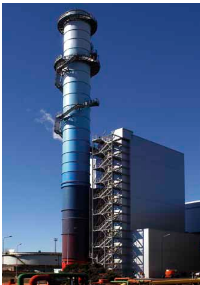
Heat recovery steam generator and chimney