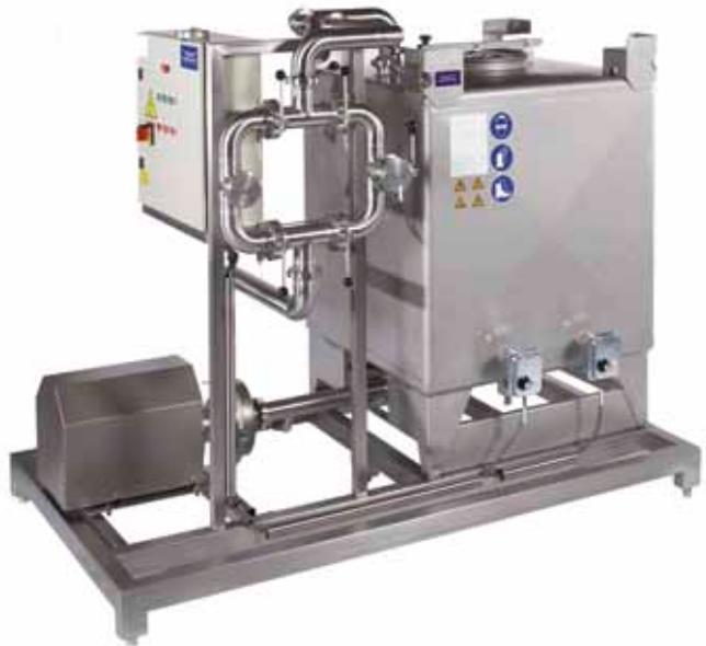
Cleaning in Place CIP 800